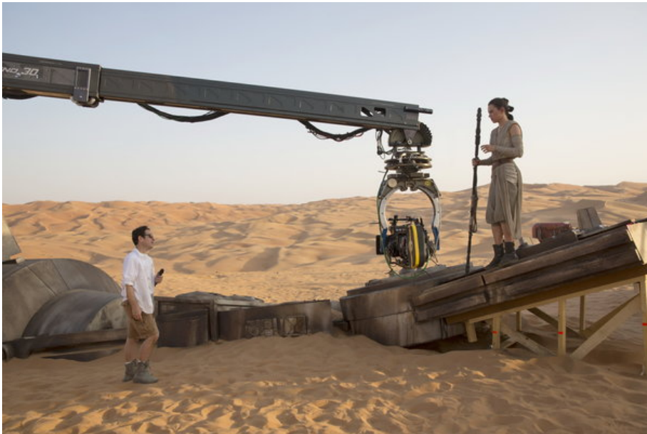
Walt Disney Studios

What to expect: With another late blessing to the lineup, SXSW-ers will get an early look at the documentary included on the forthcoming “Star Wars: The Force Awakens” DVD/Blu-ray. The hourlong, Disney-sanctioned feature on the making of our latest other-galactic behemoth will premiere on Monday, the same afternoon that J.J. Abrams is scheduled to speak on a panel alongside “The Jinx” director Andrew Jarecki.