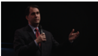
High Resolution Image 1920 x 1080