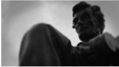
High Resolution Image 1920 x 1080