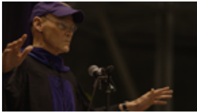
High Resolution Image 1920 x 1080