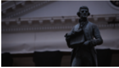
High Resolution Image 1920 x 1080