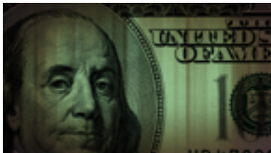
High Resolution Image 1920 x 1080